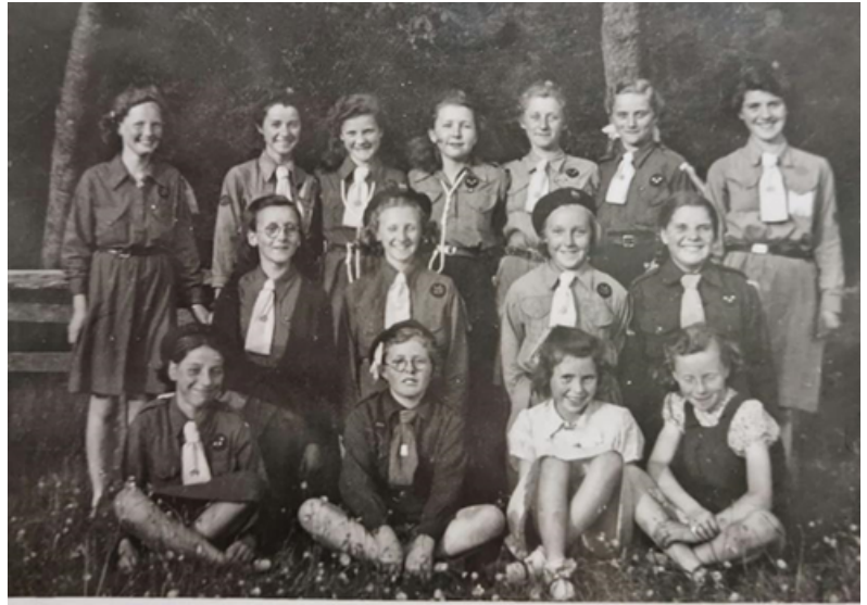
Guide hike up Leckie Glen, circa 1947

For more information about volunteering check out https://www.girlguidingscotland.org.uk/become-a-volunteer/