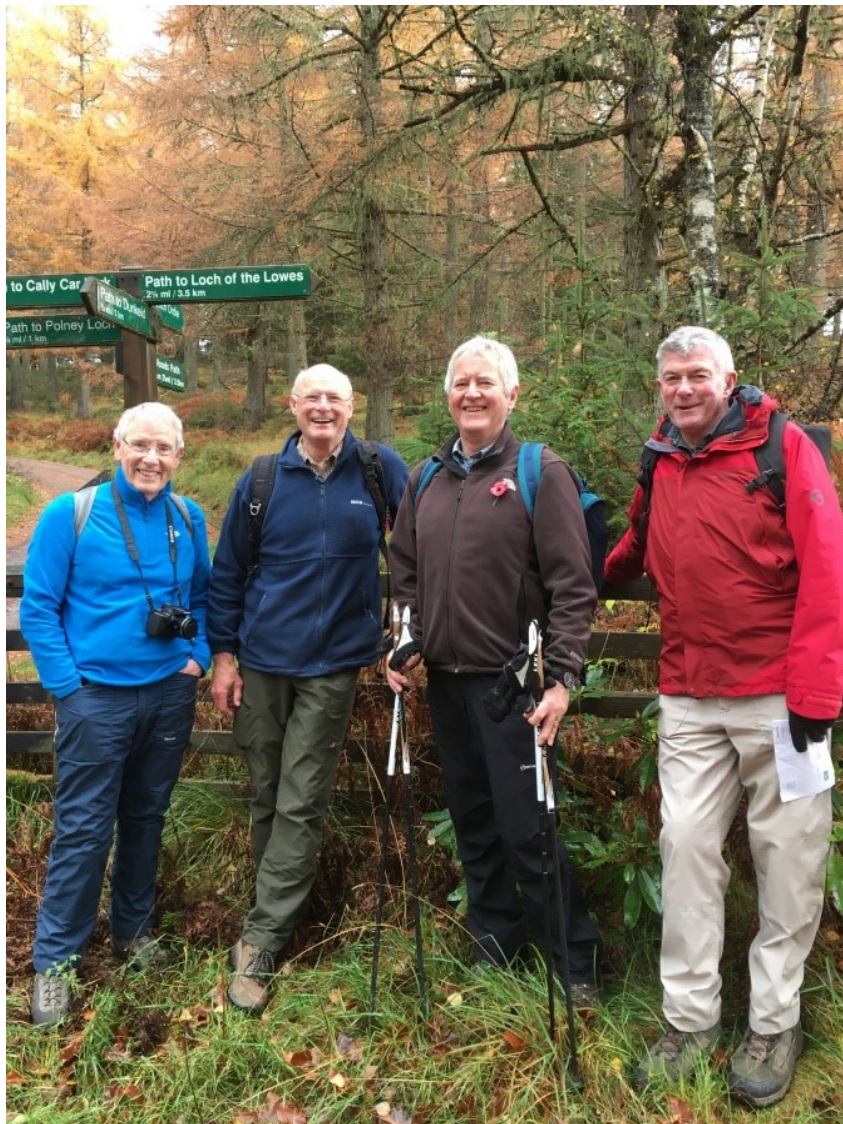
Members enjoying Autumn colours between Birnam and Loch of Lowes