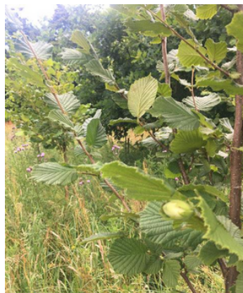
Hazel nuts growing in summer 2023