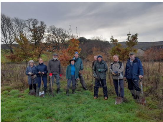
Volunteers planting crab apple and rowan trees in the Glebe Park