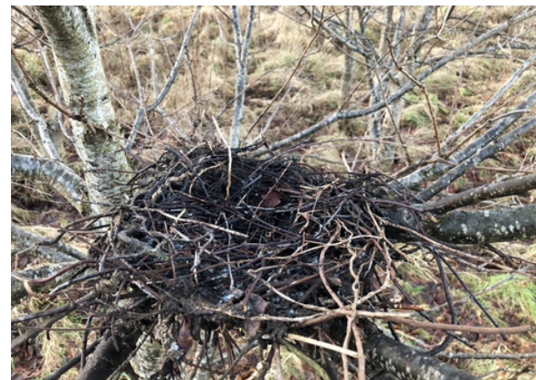
A bird's nest (dove or pigeon?) built in one of the oaks in 2023